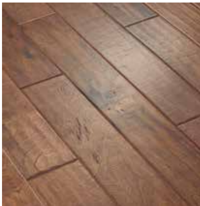
304 Burnt Barnwood