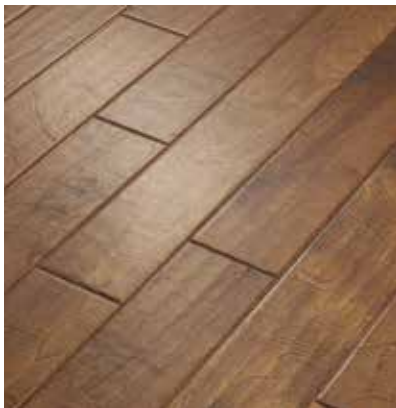
879 Warm Sunset