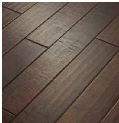
941 Weathered Saddle