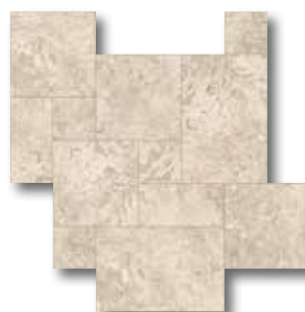
510 Castle Rock