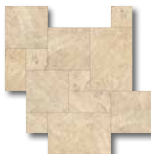
110 Sunlit Sand