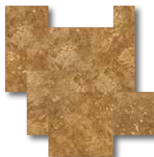
705 Park Trail