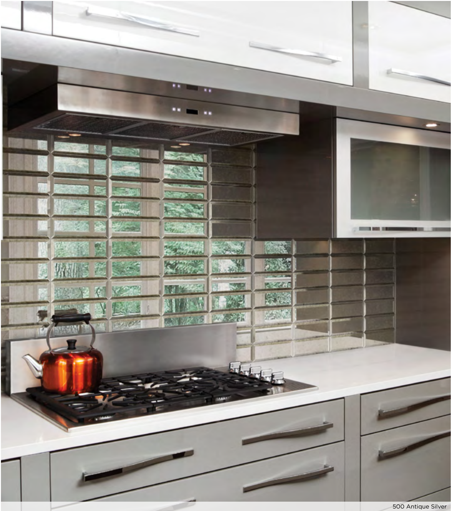
500 Antique Silver