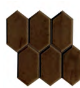
600 Antique Bronze