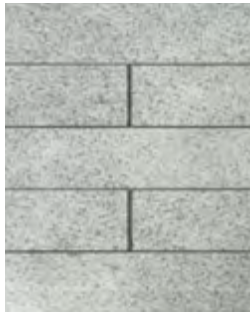
500 Antique Silver