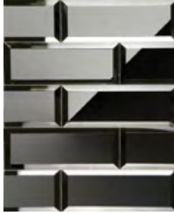
500 Antique Silver