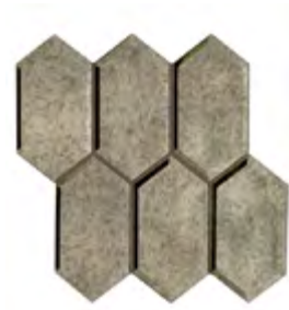
500 Antique Silver