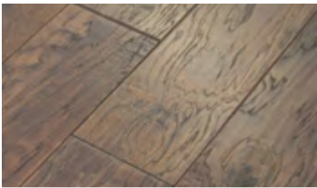
5003 Crystal Cave