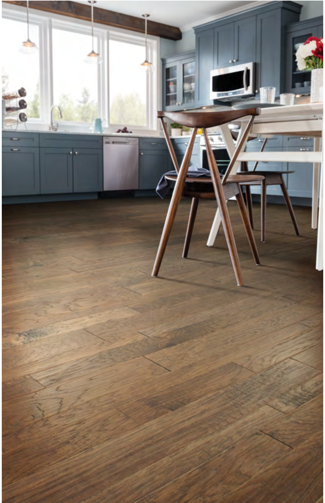
2000 Pacific Crest mixed