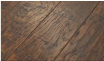
941 Three Rivers