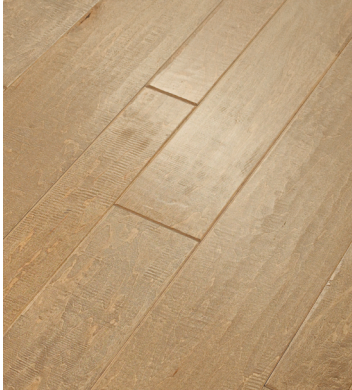
1001 Gold Dust