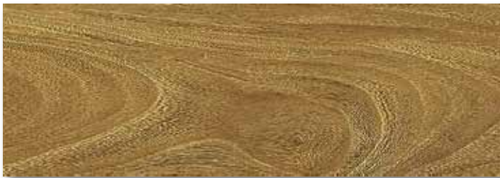
165 Rio de Sol