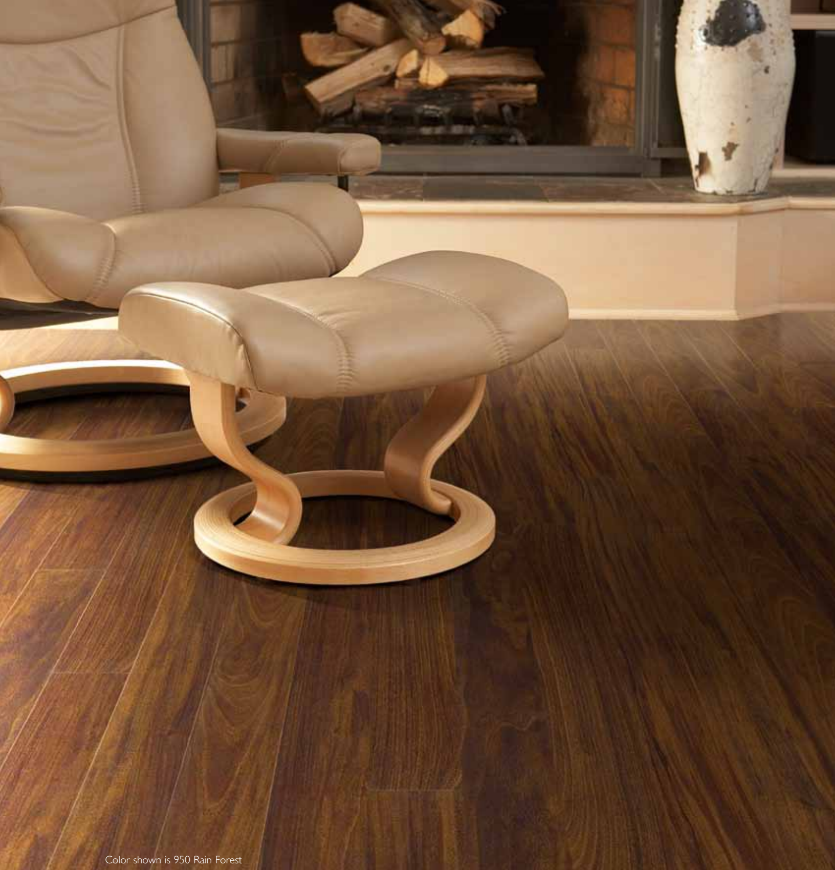
Color shown is 950 Rain Forest