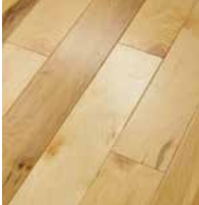
130 Maple Natural