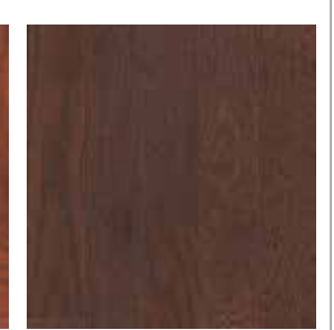
958 Coffee Bean