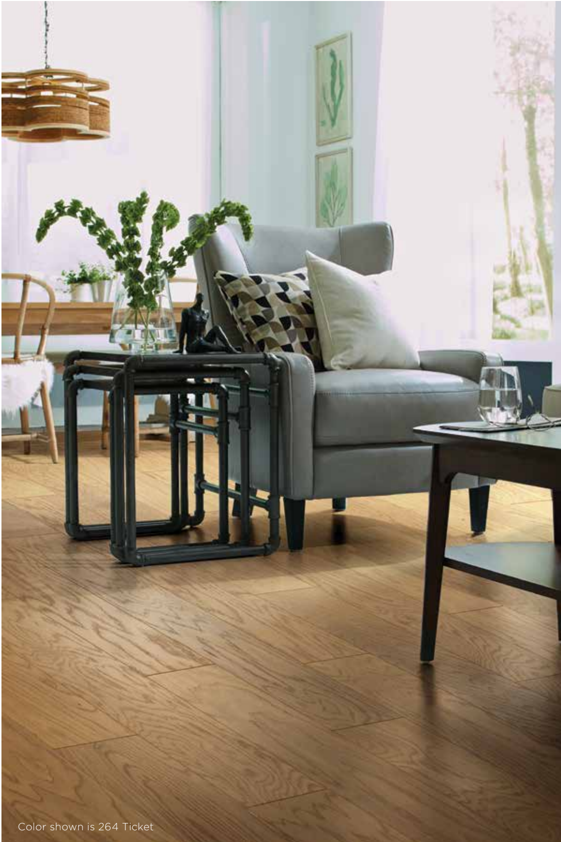
Color shown is 264 Ticket