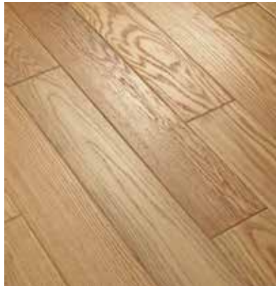
245 Honeysuckle Beach