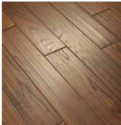
677 Rockford Red