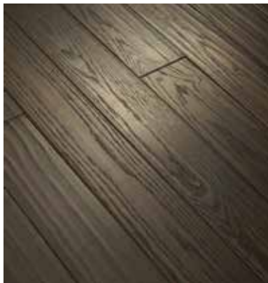
980 Sportsman Park