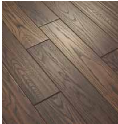
436 Tobler's Brown