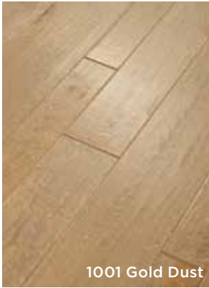
1001 Gold Dust