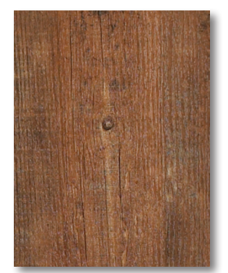
601 Vintage Plank