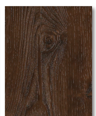
750 Smoked Pine