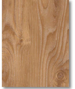
100 Natural Pine