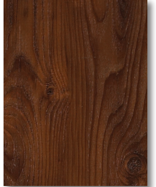
660 Timeworn Pine

Sovereign Plank | floating luxury vinyl plank