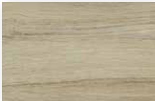
123 Corner Stone