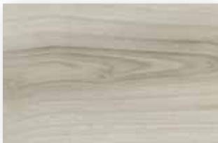
511 Picket Fence