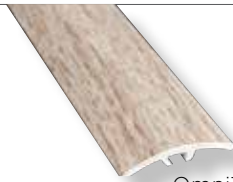
VSUN3 OmniTrim Multi-Purpose Reducer / T-Molding Length — 94"