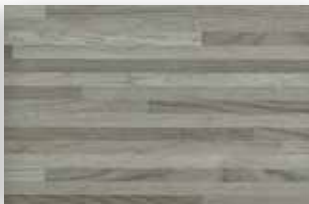
525 Soda Fountain