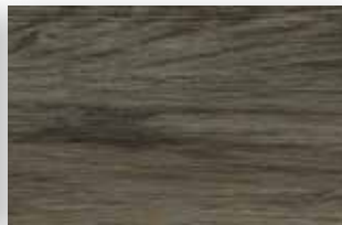
531 Town Hall