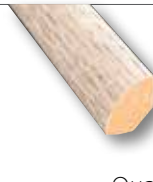
VSQT3 Quarter Round Length — 94"