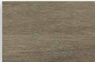
303 Fire House