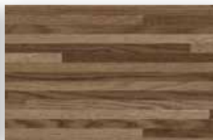
810 Coffee Shop