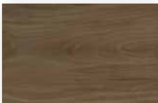
773 Rolling Hills