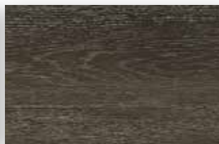
752 Country Lane