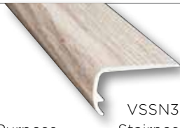
VSSN3 Stairnose Length — 94"