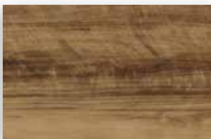
804 Craft Fair