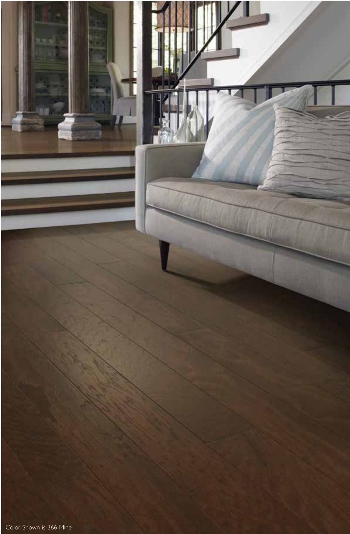
Color Shown is 366 Mine