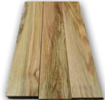
Mineral & Stain