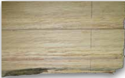
Bottom of Board Defect