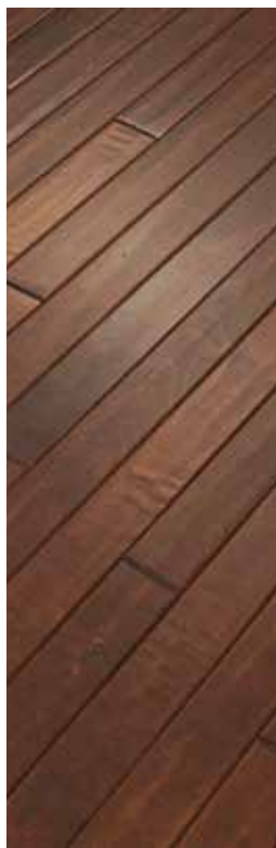
895 Maple Syrup