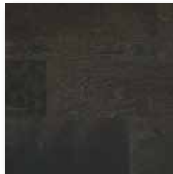
946 Black Diamond