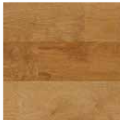
235 Snow Shoe