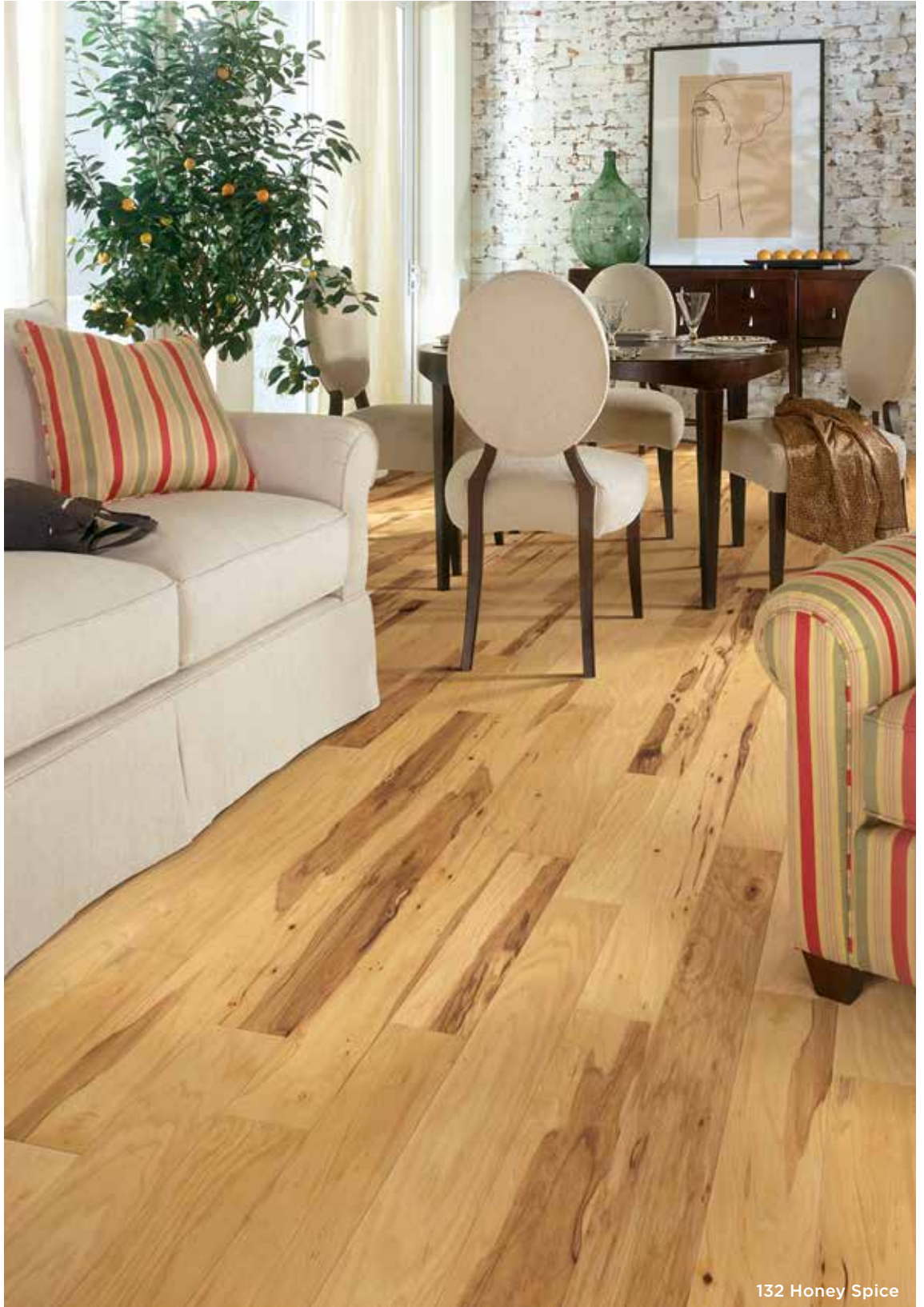
132 Honey Spice