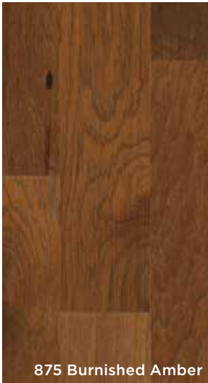
875 Burnished Amber