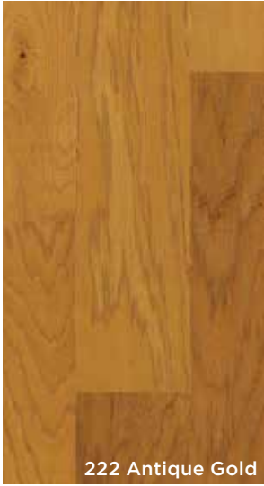
222 Antique Gold