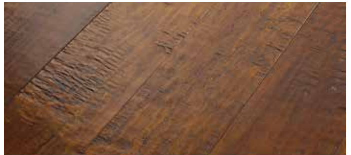
635 Granite Shores