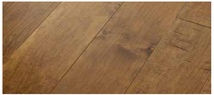
286 Sand Point