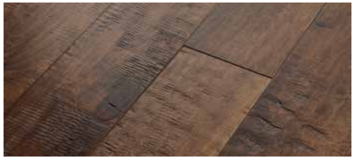
424 Bar Harbor Brown