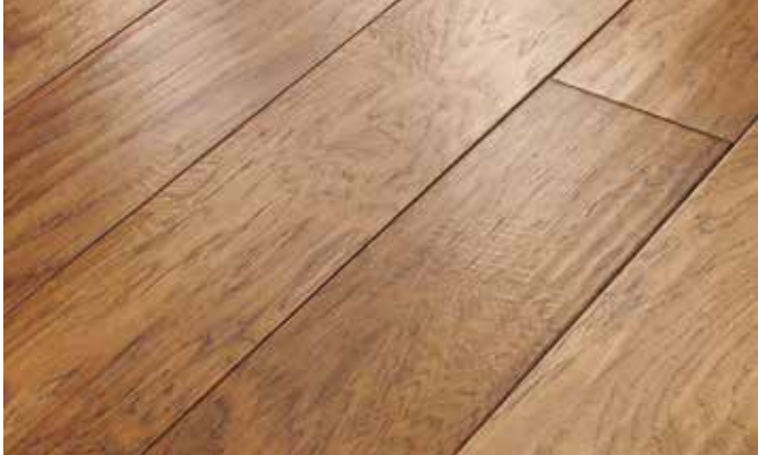
251 Country Store