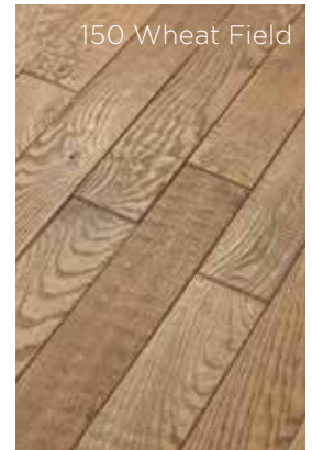
150 Wheat Field