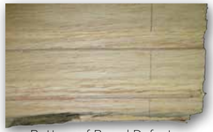
Bottom of Board Defect

Grading for Madison Oak falls within Shaw's "Rustic" or "High Variation" visual category which means that the product can include moderate to high amounts of color variation. Additionally, sound natural variations of the forest product and manufacturing imperfections including but not limited to: bark pockets, broken edge/broken corner, indentation, splits, machining imperfections, worm holes filled and unfilled, torn grain, mineral streaks in unlimited amounts, knots, unfilled character up to 3/8 of an inch, stick stain, Missing or shy tongue up to 1/4 normal size, sound rot, water marks and bottom of the board defects that do not make the